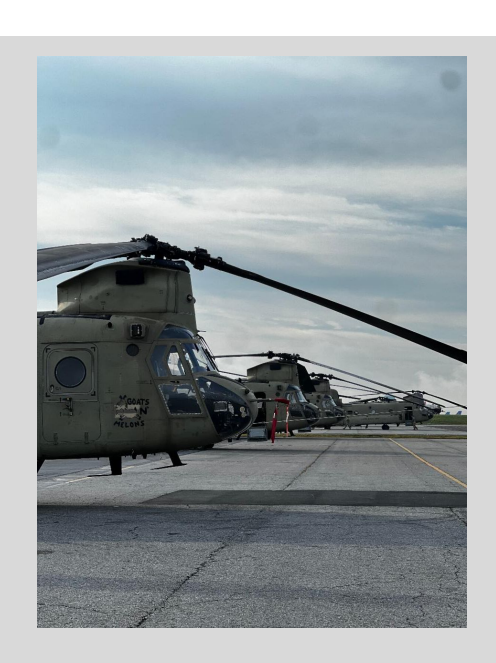
Chinooks, used in WNC relief efforts, wait on ramp