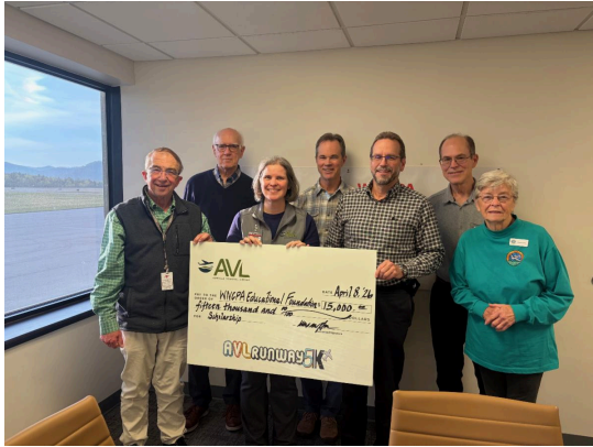
Western North Carolina Pilots Association Educational Foundation

Mark your calendars! This year's AVL Runway 5K will be held on October 3 . Stay tuned for announcements about registration, coming up soon.