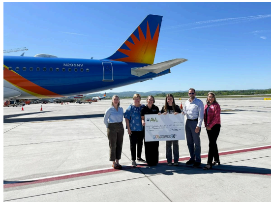
Big Brothers Big Sisters of WNC