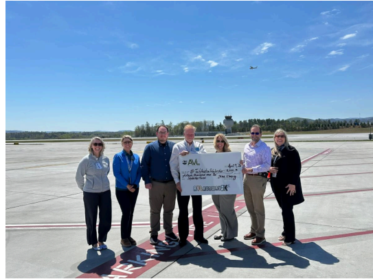
A-B Tech Aviation Scholarship Fund