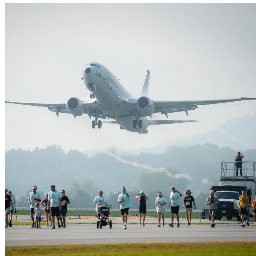
SAVE THE DATE : OCTOBER 11, 2025